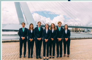
AUGUST BOARD SHOOT