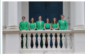
MAY BOARD ANNOUNCEMENT