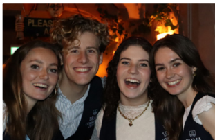
SEPTEMBER OPENING DRINK